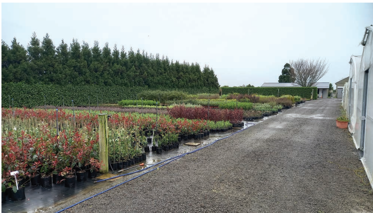
Photo: Range of plant sizes in a nursery

For the work reported here achieving a constant flow was possible. The flow rate was determined by spraying into a container for one minute and measuring the volume collected. In this case 2.9 litres was collected in one minute. This was repeated three times to determine that the flow was 2.9 litres/minute. Then the time taken to spray a series of beds of plants was measured. The areas of these beds were also measured. The results are shown below.