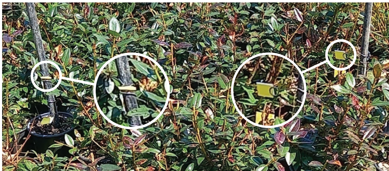
WATER SENSITIVE PAPERS

Smaller droplets improve coverage but are more prone to drift. Larger droplets have more momentum, reduced evaporative losses but require more volume for similar coverage.